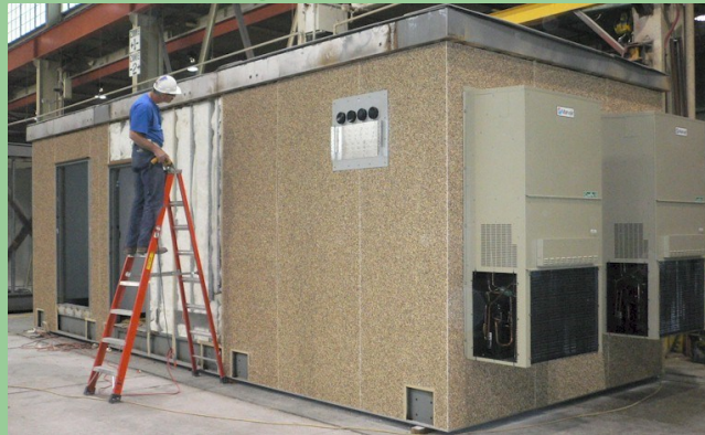
Example 12 x 30 Structure (During Construction)